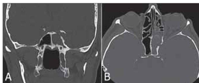
Figure 2 (A-B). Plain CT on coronal (A) and axial plane (B). Complete opacification of the sphenoid sinus, the subtle calcifications seen in the anterior part of the sinus cavity herald a fungal infection. Bone is extensively remodelled, both sclerosis and demineralization are detected.

All patients underwent endoscopic sphenoid sinusotomy with debridement of sinus content; a sample of sphenoid sinus mucosa was sent for histological examination in all cases. When a mycosis was suspected at imaging or intraoperative evaluation, the material inside the sinus was also analyzed. Based on intraoperative and histological findings, the final diagnosis was mucocoele or mucopyocoele in 7 (64%) patients, acute sinusitis in 2 (18%), and fungus ball and chronic indolent mycosis in 1 (9%) case each. No perioperative complications were observed; permanent patency of sphenoidotomy was obtained in all cases.